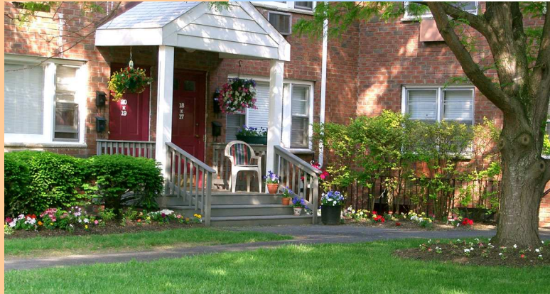
Thanks for the flowers K-Building, they beat fruit baskets any day.

Log on to www.apartmentratings.com and post a review